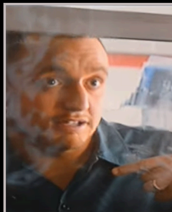
“Identity Thief” Universal Pictures