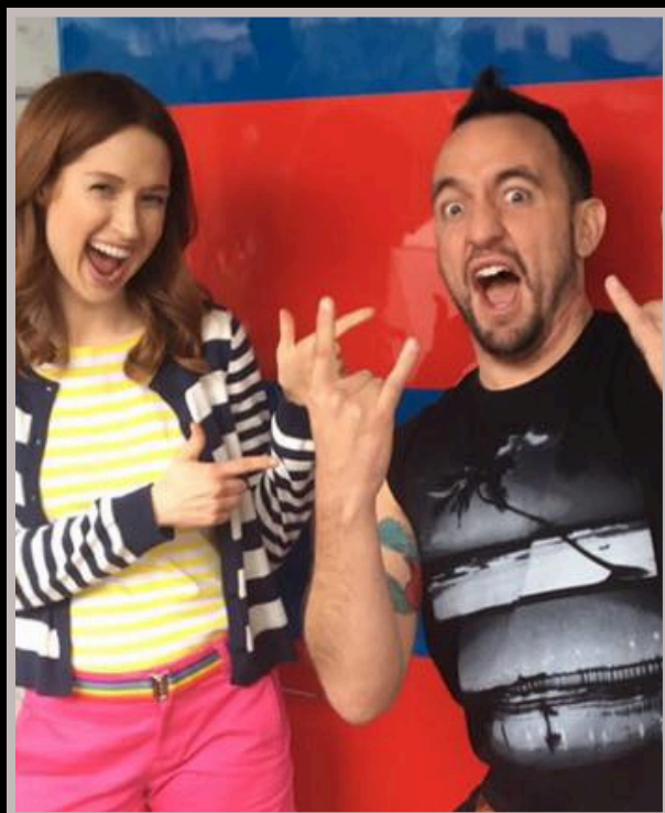
“Unbreakable Kimmy Schmidt” Netflix