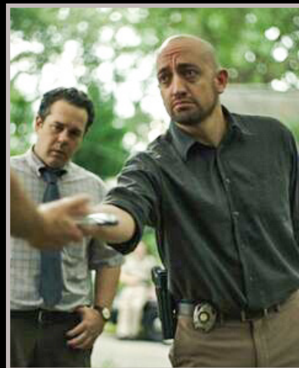
“The Outsider” HBO