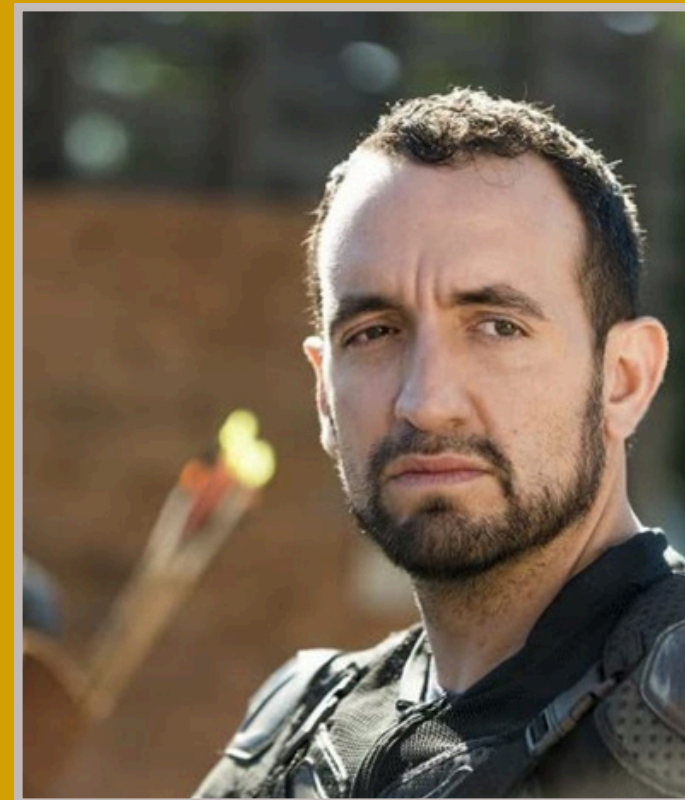
"The Walking Dead" AMC