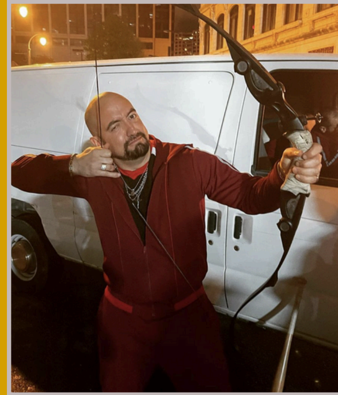
"Hawkeye" Marvel Studios